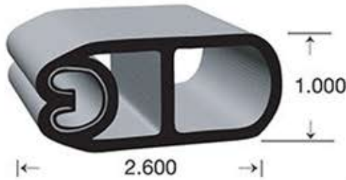
G-7014 ▲ ✓ (FS: .125")