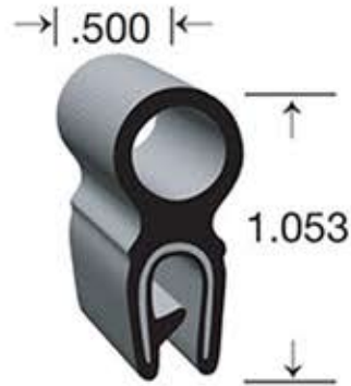
G-7011-T ▲ (FS: .125") G-7011-TW ▲ ✓ (FS: .125")